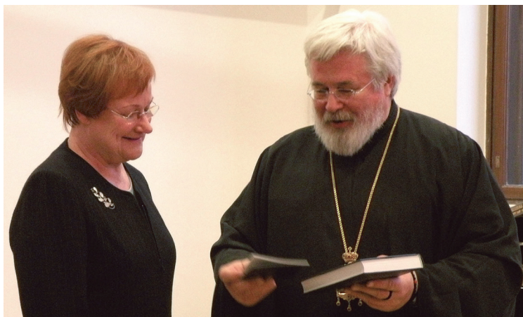
President of Finland, Ms Tarja Halonen, and Orthodox Archbishop Leo, who is the Chair of the Karelian Language Association, discuss the Kalevala saga which was published in Karelian on 3 December 2009.

Regardless of the highly endangered position of the Karelian language, the possibilities for revitalising the language and culture are relatively good. The Karelians and Karelian-speaking people can thus also in the future contribute to the development of Finnish society and cultural life at least as effectively as they have done so far.